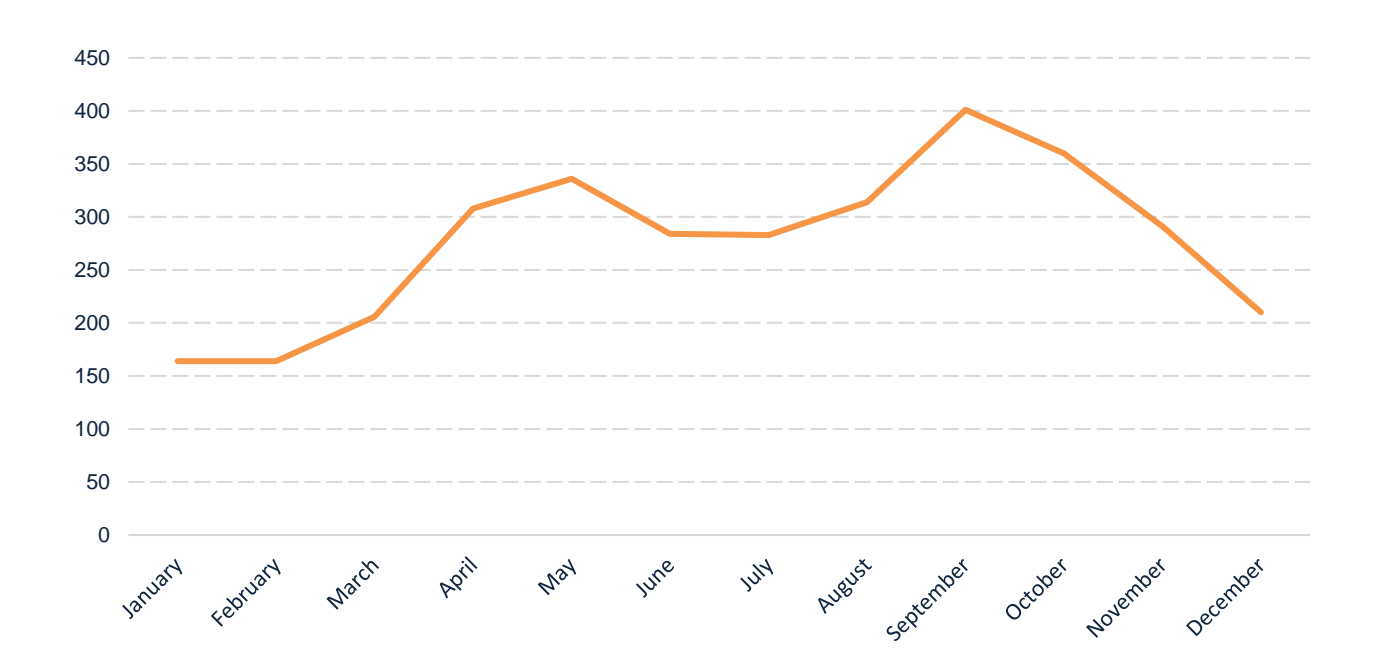
Chart 3. Marriages and divorces by months, 2018

Wedding month is September. In September, there were 401 marriages which is 12.1% of the total number of marriages.