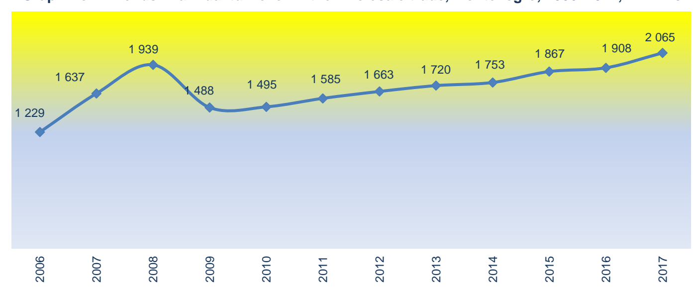
Graph No 1: Trends in annual turnover in the wholesale trade, Montenegro, 2006–2017, in mill €