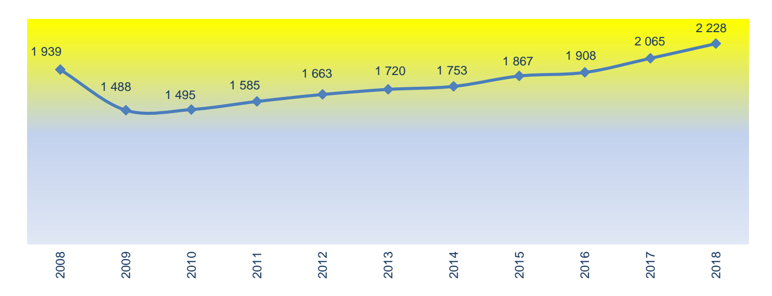
Graph 1. Trends in annual turnover in the wholesale trade, Montenegro, in mill EUR

Turnover in the wholesale trade in Montenegro in 2018 was 2 228 mill EUR, which represents an increase of 7.9% compared to 2017. The largest share in total turnover trade have the groups in the field of nutrition which make 28.9% of total turnover in the wholesale trade.