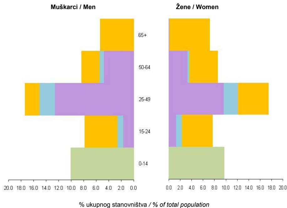
Grafikon 1. AKTIVNOST STANOVNIŠTVA PO POLU I STAROSNIM GRUPAMA, CRNA GORA PRVI KVARTAL 2010 Chart 1. ACTIVITY BY SEX AND AGE GROUPS, MONTENEGRO 1 st QUARTER 2010

In the the 1 st Quarter 2010 in Montenegro there were: Active population was 259.3 thousands. Among the population, there were: 207.8 thousand employees or 40.0%; unemployed 51.5 thousands or 19.9%. Number of employees in comparison to the previous year decreased by 0.6% and the number of unemployed decreased by 3.5%. The activity rate was 49.9, the employment rate was 40.0 and unemployment rate was 19.9.