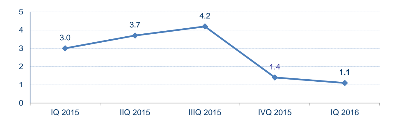
Table 2: Quarterly GDP by expenditure approach at current prices