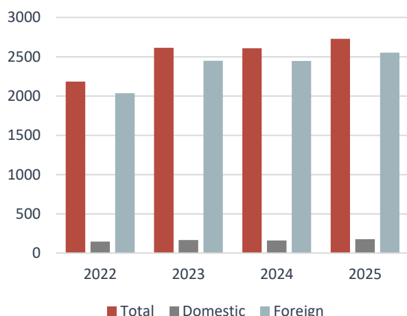
Graph 1 Tourists arrivals, in thous.